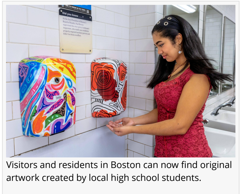
Visitors and residents in Boston can now find original artwork created by local high school students.

Beyond the winning design, the program produced artwork ranging from space travel inspired visuals to veteran tributes. Each piece represents not only student creativity but also the power of design to shape public experiences.