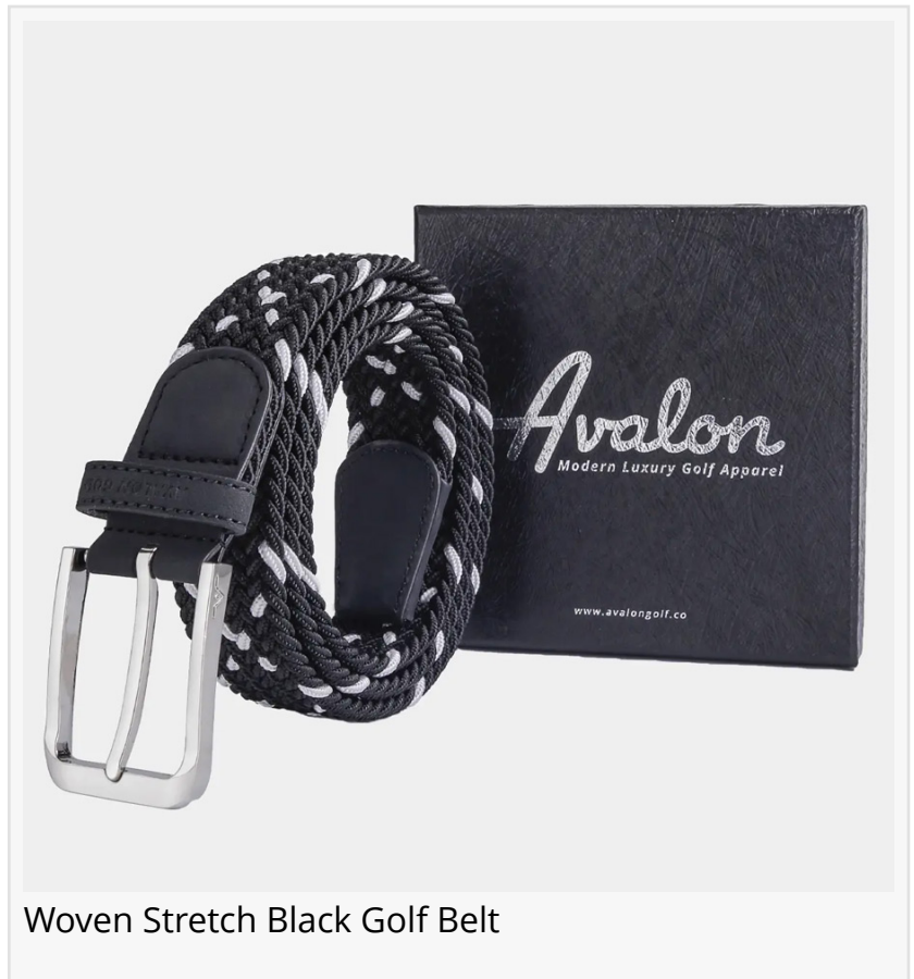
Woven Stretch Black Golf Belt

The blade collar golf shirt and men's golf polos introduced for Spring 2026 highlight Avalon's continued innovation in technical apparel. Crafted from soft-touch, cooling microfibers, the polos maintain a structured fit while enhancing airflow and moisture control. The distinct blade collar golf shirt offers a modern alternative to the traditional polo collar, giving a minimalist and athletic finish favored by contemporary players. Featuring UPF protection and anti-microbial properties, Avalon's mens golf polos bridge sophisticated style with active performance, ensuring comfort and refinement round after round.