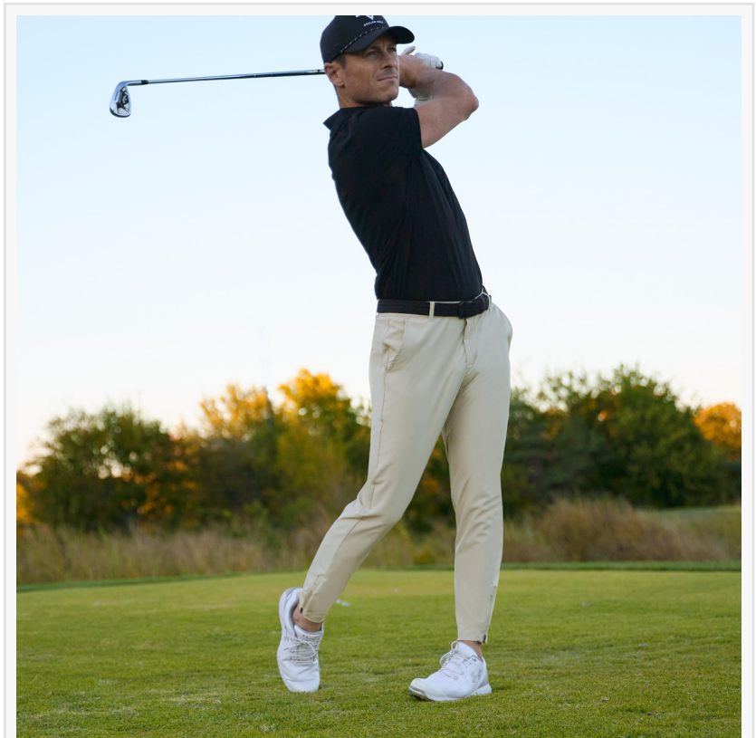
Performance Golf Joggers II - Lifestyle Photo