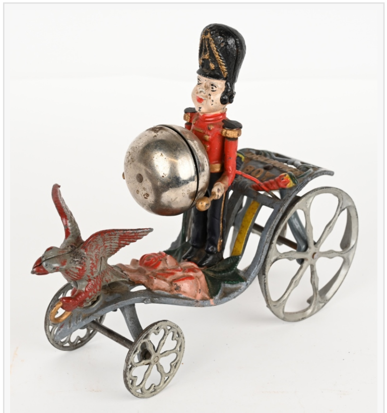
Rare cast-iron Drummer Boy Chariot bell toy made circa 1895 by Gong Bell. Wonderful design and colors with excellent detail and casting. Superb original paint. In Excellent-NM condition, it sold for $12,000 against an estimate of $4,

This press release can be viewed online at: https://www.einpresswire.com/article/886998279