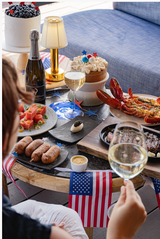
CUT Above at Rosewood Washington, D.C.