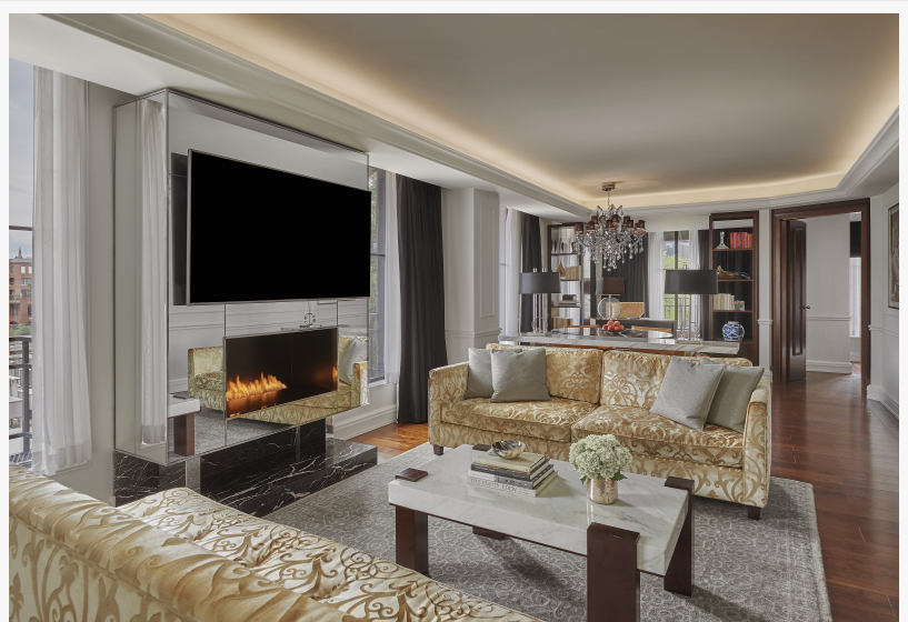
Presidential Suite at Rosewood Washington, D.C.

America's 250th Celebration by Rosewood - A once-in-a-generation four-night experience for up to eight