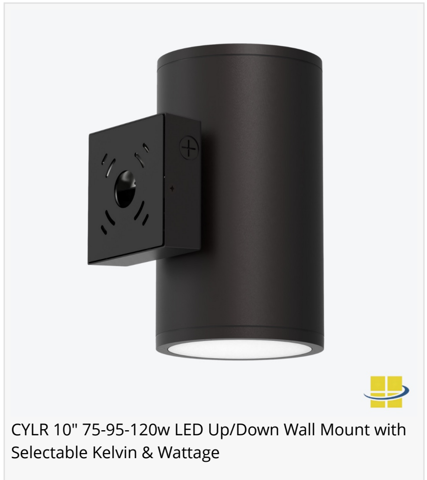
CYLR 10" 75-95-120w LED Up/Down Wall Mount with Selectable Kelvin & Wattage

CYLR Wall Mount LED Lights - Product Line Differentiation