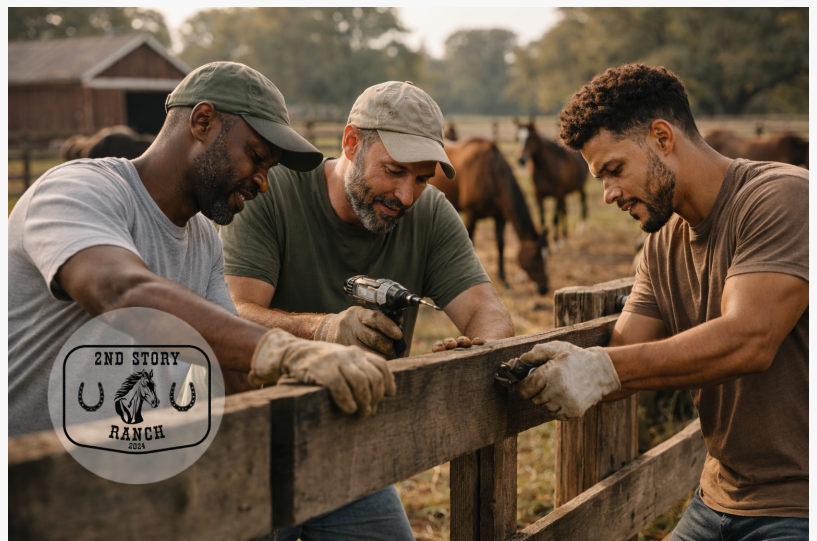
Second Story Foundation announces First Furrow Fund.

CHICAGO, IL, UNITED STATES, February 6, 2026 /EINPresswire.com/ -- The Second Story Foundation today announced the launch of the First Furrow Fund , a new initiative established through a GoFundMe campaign to provide paid, short-term employment for men completing residential substance use disorder treatment and entering recovery housing. Participants begin work within days of discharge, providing early income during a period when housing stability and financial continuity are essential.