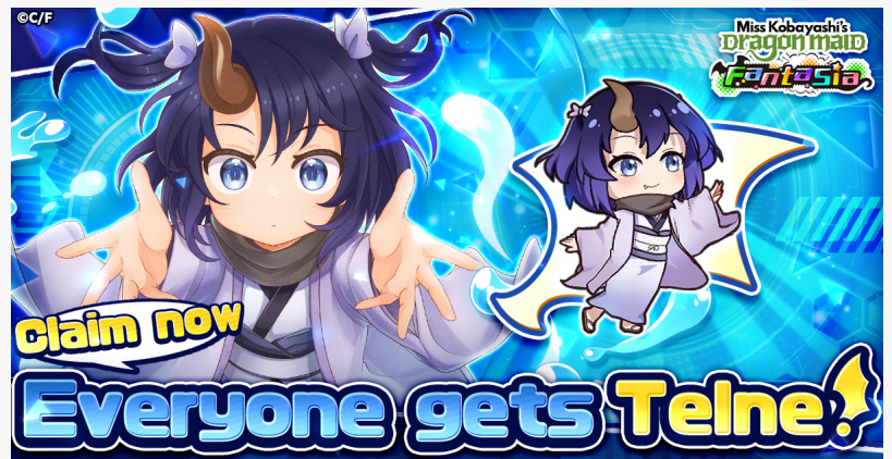
Claim now! Everyone gets "Telne!"