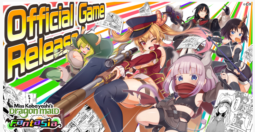
Miss Kobayashi's Dragon Maid Fantasia Officially Releases!

To commemorate the launch, CTW Cayman announced an in-game campaign in which players who begin playing during the campaign period can obtain the ally character "Telne." Telne is designed to support players during the early stages of gameplay.