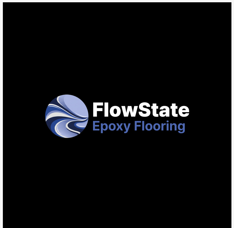
FlowState Epoxy Flooring Logo