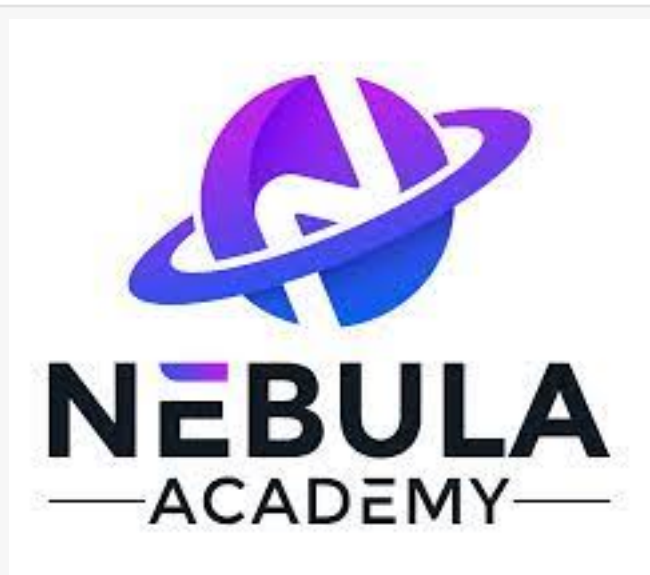
Nebula Academy logo