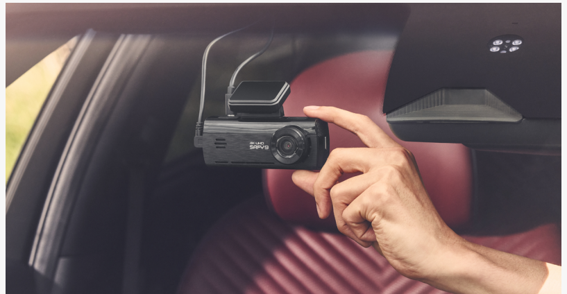
SAFY9 4K Dash cam

SAFY redefines the modern dash cam experience, offering drivers worldwide unparalleled peace of mind.