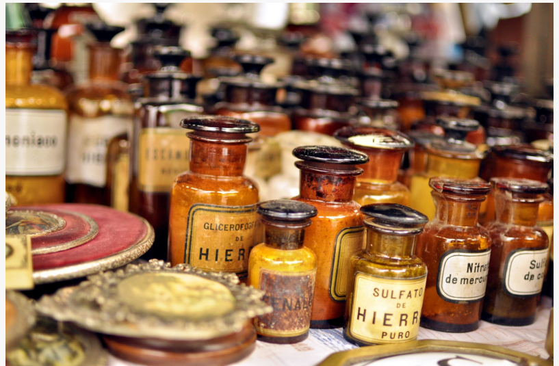
Historic apothecary bottles used for medicinal preparations

This press release can be viewed online at: https://www.einpresswire.com/article/887871942