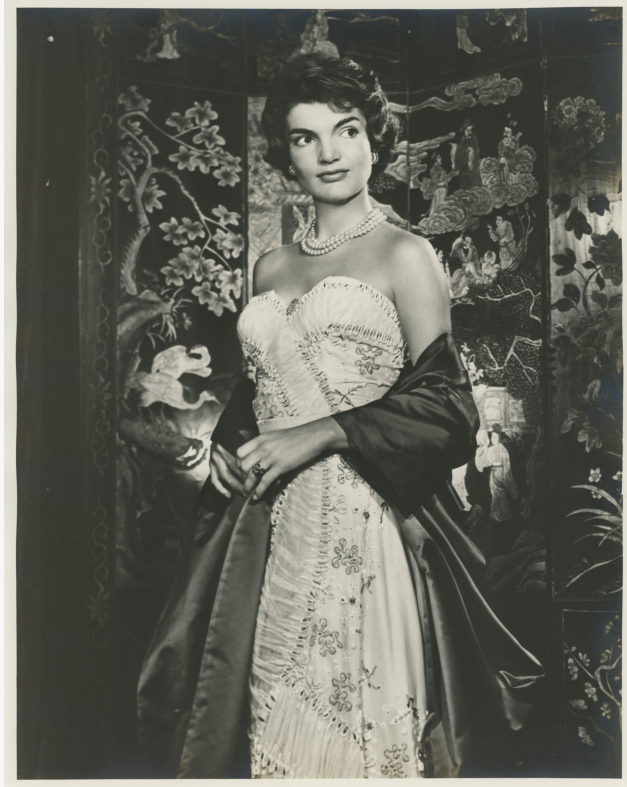
Jacqueline Kennedy period 8-inch-by-10-inch silver gelatin photograph by Yousuf Karsh, depicting the First Lady in an elegant formal portrait. Estimate: $250-$350