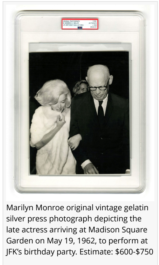
Marilyn Monroe original vintage gelatin silver press photograph depicting the late actress arriving at Madison Square Garden on May 19, 1962, to perform at JFK's birthday party. Estimate: $600-$750

Lot #33 is a Marilyn Monroe original vintage gelatin silver press photograph depicting the late actress arriving at Madison Square Garden on May 19, 1962, to perform her iconic rendition of "Happy Birthday, Mr. President" for JFK at a Democratic National Committee fundraiser. Monroe