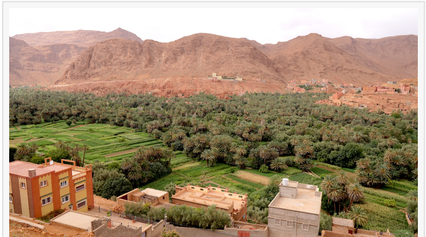
Todgha Valley - Tinghir Morocco

broader initiative to increase its presence in the North American market, the agency is leveraging professional media distribution to connect travelers from the United States and Canada with highly personalized, privately guided experiences across the Moroccan Kingdom.