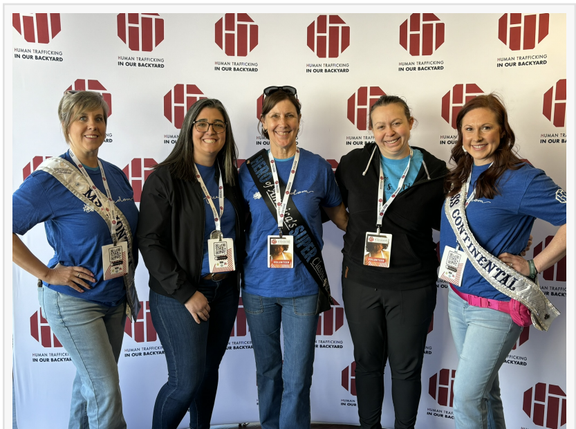
Volunteers transform awareness into action

with training and resources to recognize and safely report concerns. Today, more than 51,000 convenience stores nationwide participate in CSAT, reaching 8 million people every single day. By placing these resources in convenience stores, IOB and its partners, the Santa Clara Human Trafficking Task Force, and the South Bay Coalition to End Human Trafficking ensure that