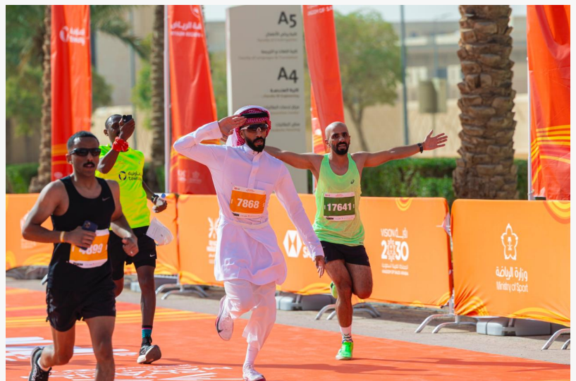
Riyadh Marathon Concludes its 5th Edition (2)

This edition marked the first-ever launch of the Riyadh Marathon Festival. The four-day festival featured a diverse program of sporting, entertainment, and cultural activities that attracted strong public interest. The festival welcomed more than 52,000 visitors, alongside broad participation from partners and stakeholders, contributing to an enhanced event experience and