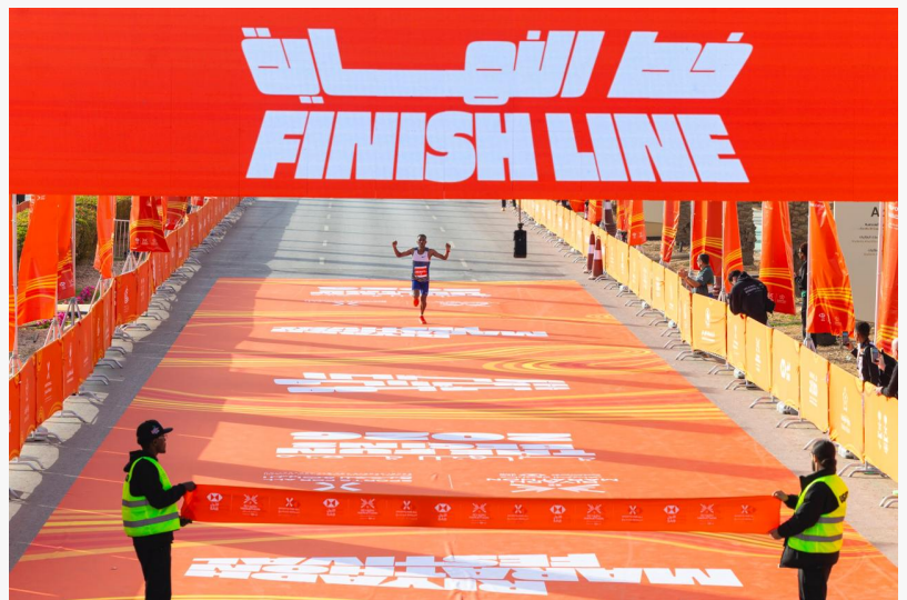
Riyadh Marathon Concludes its 5th Edition (3)