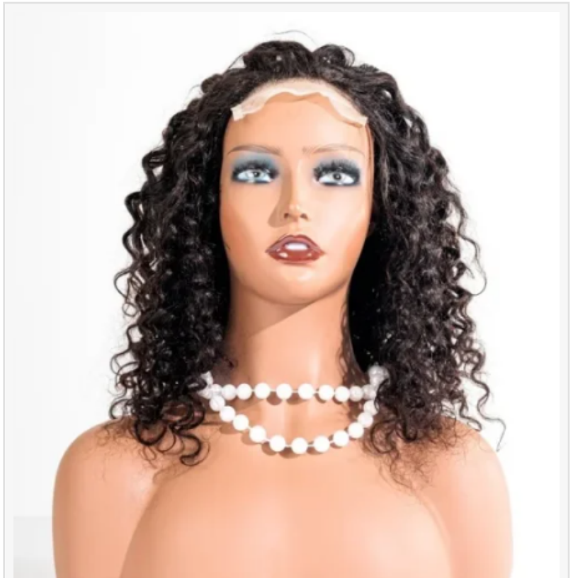
italy curly lace frontal

Texture accuracy remains a key service focus. Hair to Waist Xtensions explains how curls and waves respond to washing, styling, and daily wear. The company notes that results may vary based on care methods. This approach helps reduce gaps between online images and real-world use.