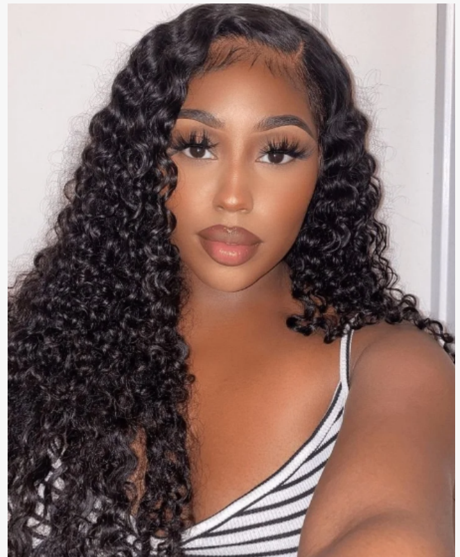
curly hair wigs for black women.