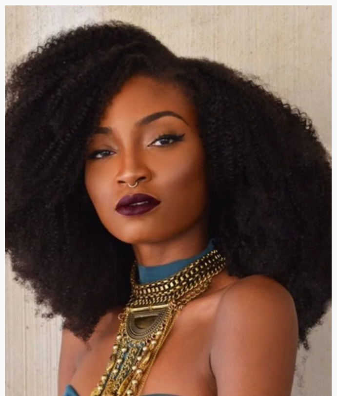
kinky wig for black women.