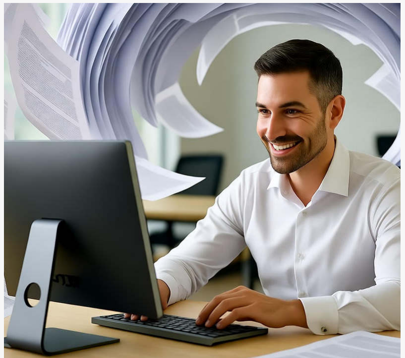
User with Cloud Document Management