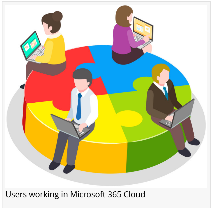
Users working in Microsoft 365 Cloud

This press release can be viewed online at: https://www.einpresswire.com/article/888604073