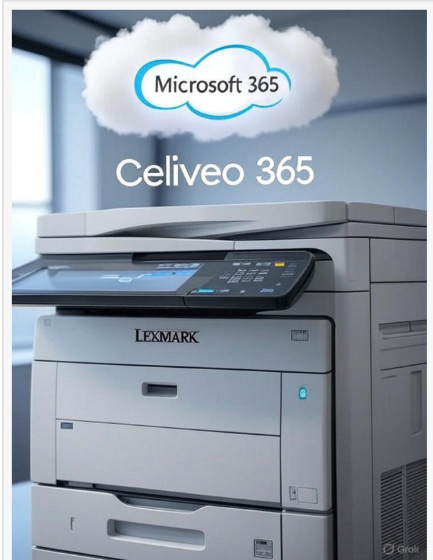
Cloud print for Lexmark printers with card reader, integration with Entra ID