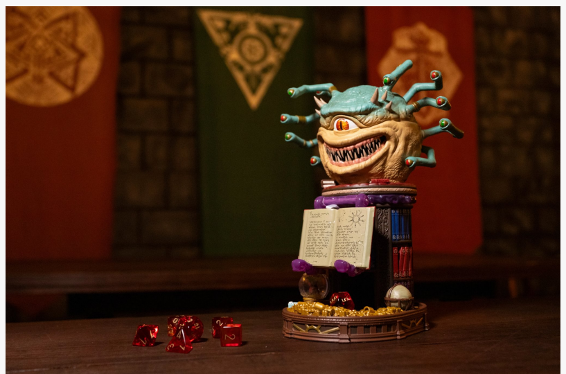
EXG Pro Xanathar Cable Guy