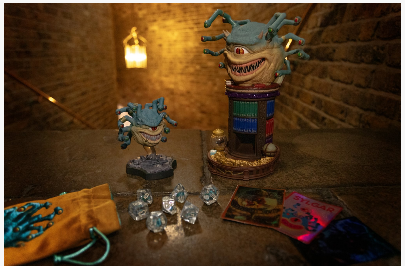
Xanathar Cable Guy - Gamefound

This press release can be viewed online at: https://www.einpresswire.com/article/888611002