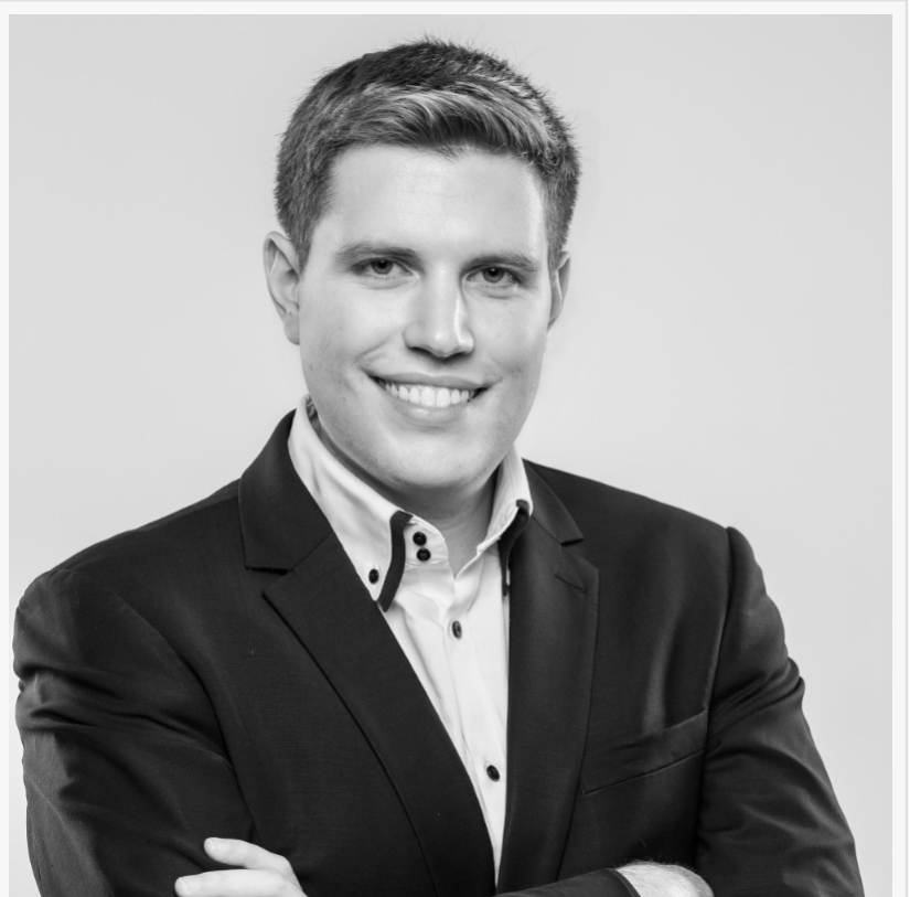
Author, Eugene Theodore

"Your collapse is someone else's business plan," Theodore writes. "The system doesn't break. It does exactly what it was built to do."