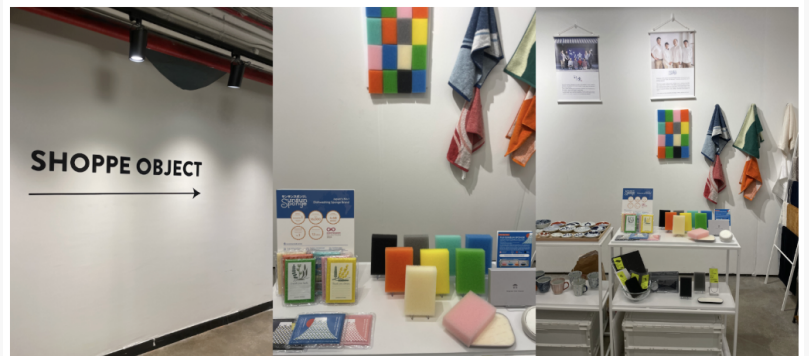
Scenes from Dainichi Corporation Co., Ltd.'s Exhibition at SHOPPE OBJECT New York (2025)