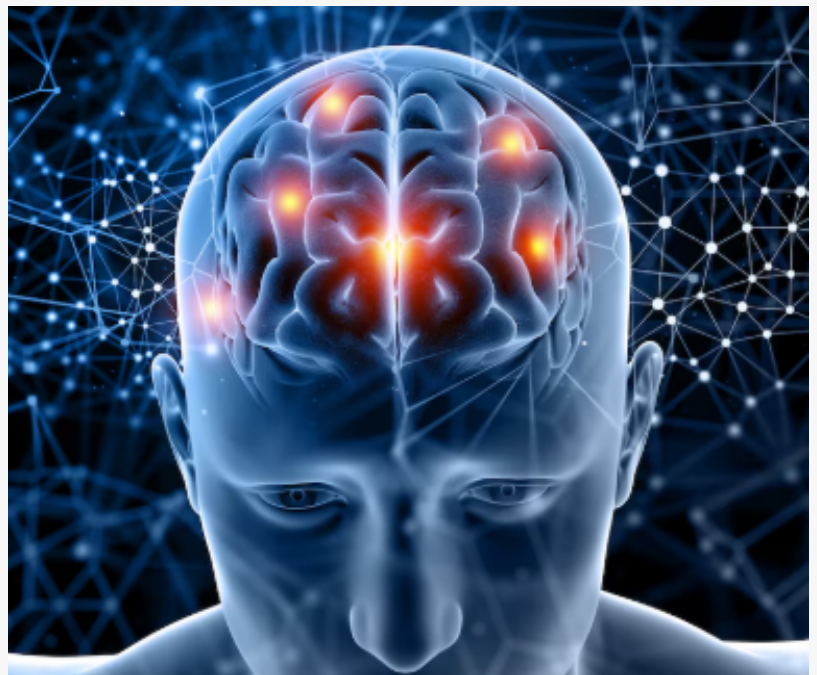
BrainTap Focus Training

Rejuven8U's BrainTap focus training is a special program that uses light, sound, and guided audio to help the brain work in a balanced and healthy way. The program is designed to help people feel calmer, pay better attention, manage stress, sleep well, and improve overall brain performance. The technology is non-invasive, which means it does not require surgery or medicine.