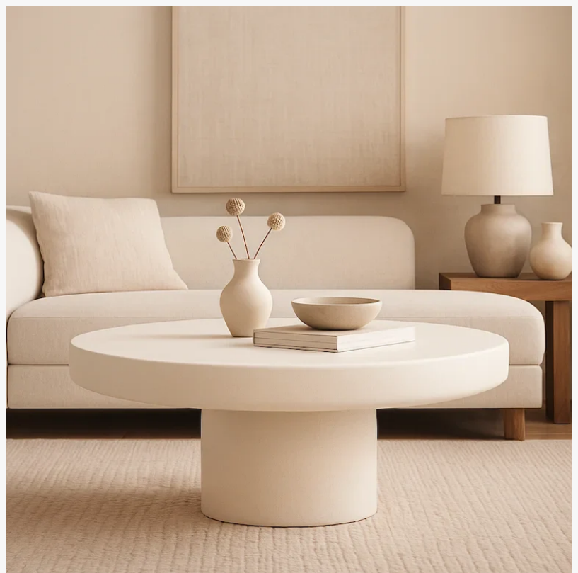
Durable concrete coffee tables adding elegance to contemporary interiors

The latest trends in concrete tables go beyond traditional shapes. Designers have introduced round concrete coffee tables for a softer, more approachable