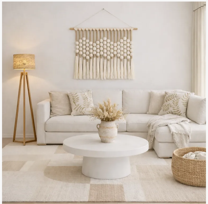
Stylish concrete side tables perfect for modern living spaces

Concrete is renowned for its durability, which makes it perfect for high-traffic areas and homes