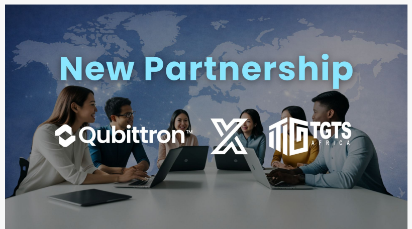
Qubittron and TGTS Africa Form Regional Partnership to Deliver SAP and AI Modernization Across West Africa

OAKVILLE, ONTARIO, CANADA, February 5, 2026 /EINPresswire.com/ -- Qubittron Consulting Inc. today announced a strategic regional SAP solutions partnership with TGTS Africa . The partnership combines Qubittron's global SAP and AI transformation expertise with TGTS Africa's strong regional delivery presence and experience supporting enterprise and public-sector institutions across Ghana and West Africa.