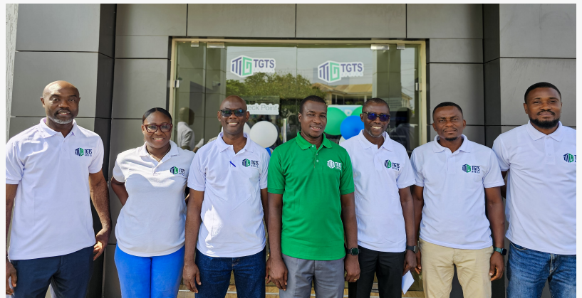
Members of the TGTS management team during a joint engagement, marking a milestone in the ongoing collaboration and mutual partnership.

An overview of how AI-driven workflows, context-aware intelligence, and scalable SAP-aligned architectures transform modern enterprises.