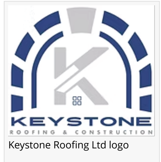
Keystone Roofing Ltd logo

/EINPresswire.com/ -- Keystone Roofing Ltd , the premier choice for emergency roofers in Cork, today announced the full mobilization of its rapid response units following the catastrophic impact of Storm Chandra. The company has transitioned to a 24-hour emergency footing to address a surge in critical structural failures, including roof leaks, displaced slates, and compromised chimney stacks affecting residential and institutional properties across the region.