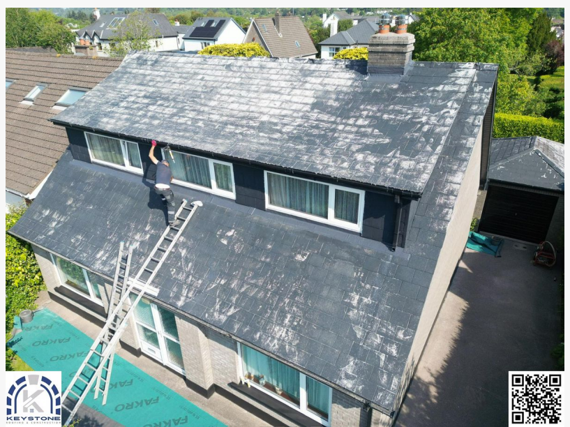
storm emergency roofing service in cork