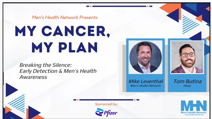
Episode one of "My Cancer, My Plan" Podcast