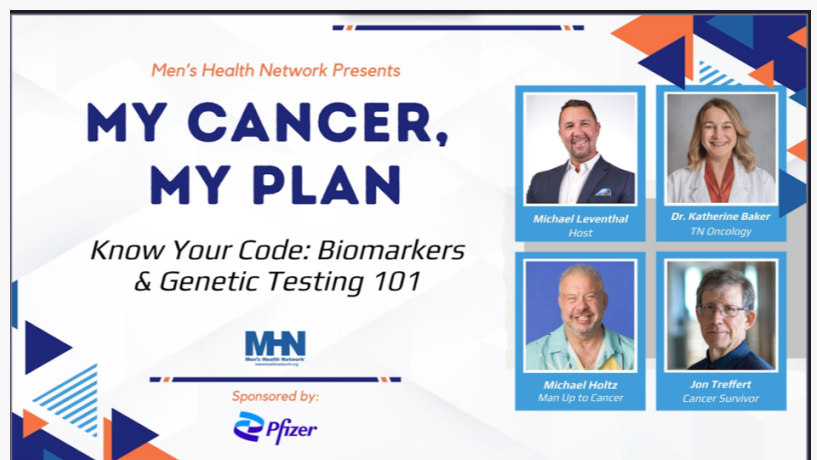
Episode two of "My Cancer, My Plan" Podcast