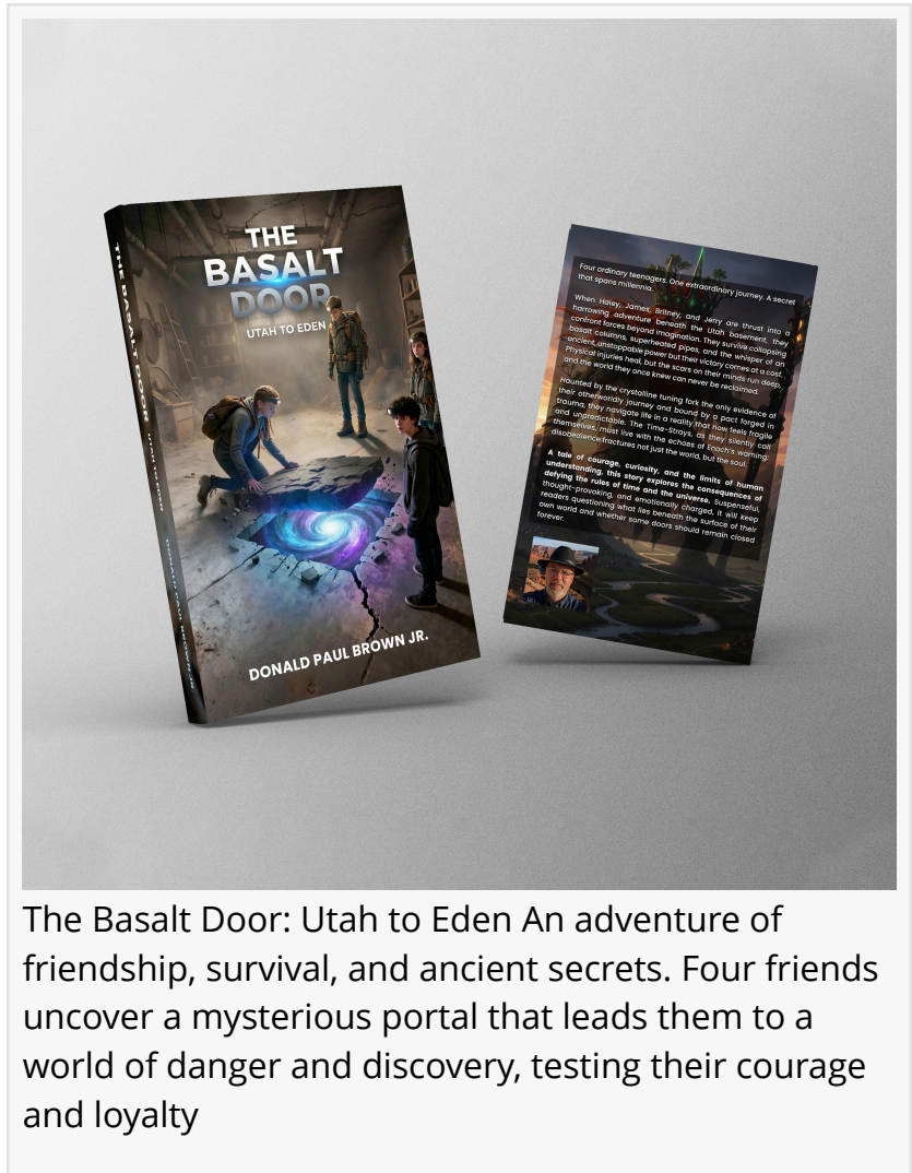
The Basalt Door: Utah to Eden An adventure of friendship, survival, and ancient secrets. Four friends uncover a mysterious portal that leads them to a world of danger and discovery, testing their courage and loyalty

1- Britney, the stabilizer, struggles with her need for control as chaos unfolds around her, yet