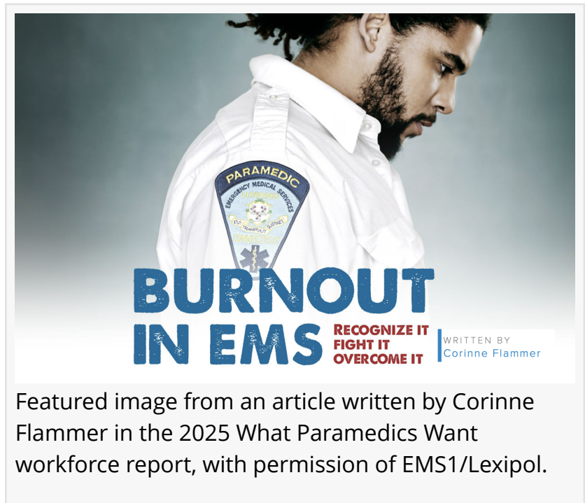
Featured image from an article written by Corinne Flammer in the 2025 What Paramedics Want workforce report, with permission of EMS1/Lexipol.

Building on the Essential course, the Academy is also announcing the launch of its Advanced Communication Course: The Language of Leadership, designed for supervisors, managers, and executives navigating high-stakes conversations in increasingly strained systems.