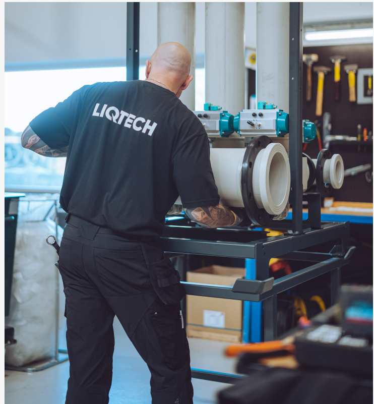
Assembly and quality control