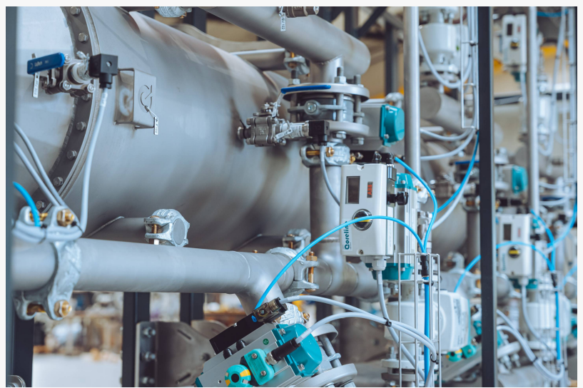
Close-up: QureFlow Max water treatment system

At the conference, LiqTech will present field validation data from North American produced-water operations, demonstrating QureFlow Max’s ability to consistently remove more than 99 percent of oil and suspended solids while maintaining stable performance despite fluctuating feed conditions, including changes in oil concentration, water chemistry, temperature, and flow.