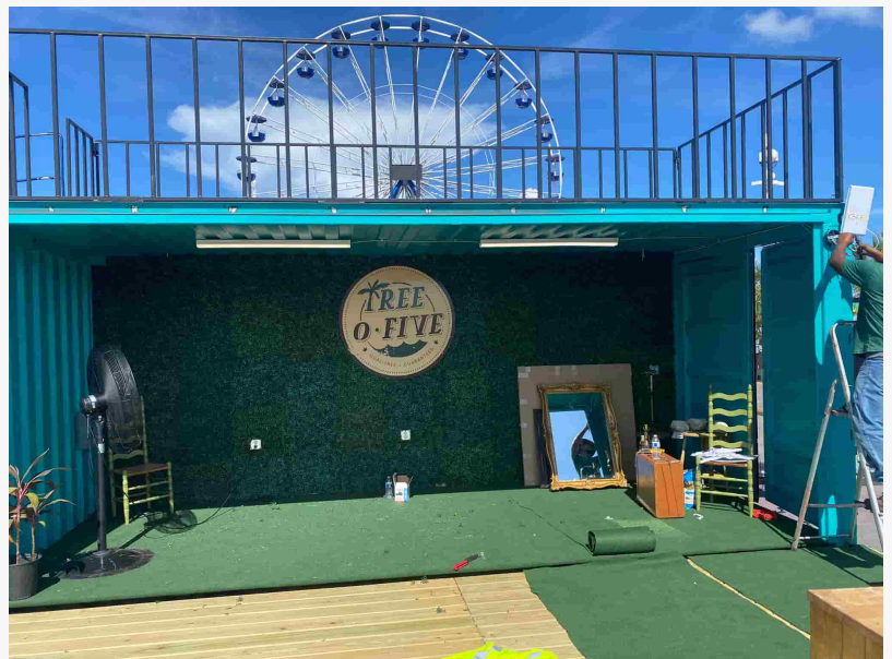
Shipping Container Modifications