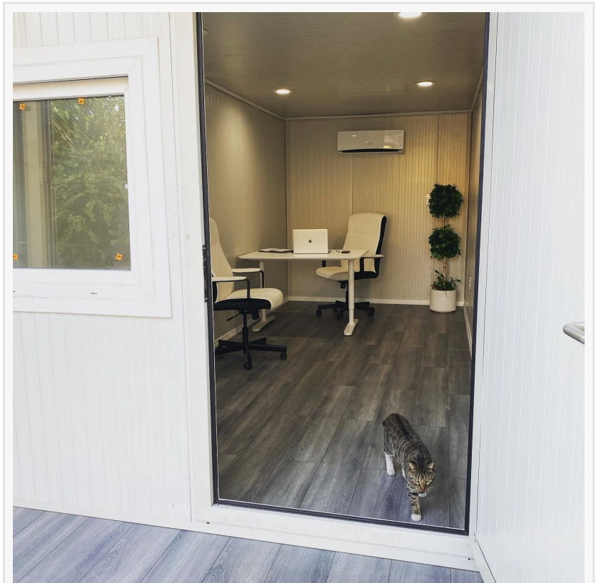
Modified shipping containers