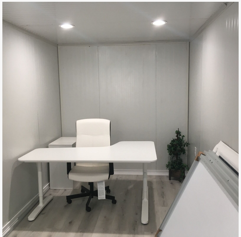
Shipping container offices