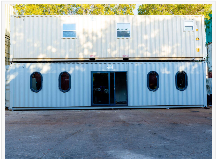
Portable office containers for sale