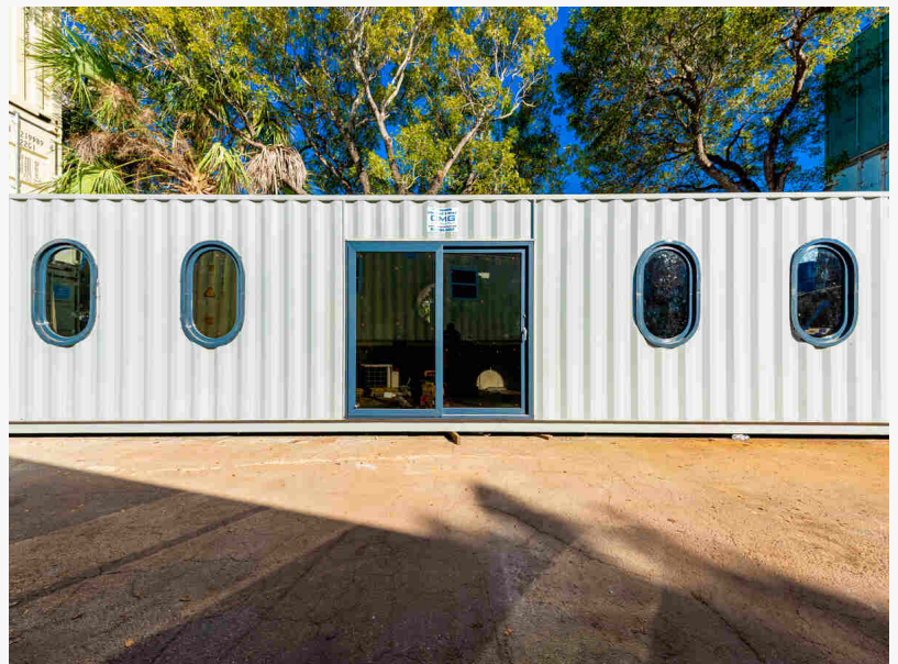
Office Containers for Sale