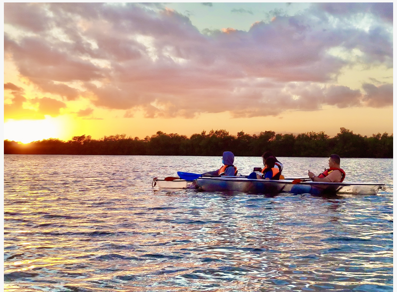
Cocoa Beach Sunset - Bioluminescence Tour