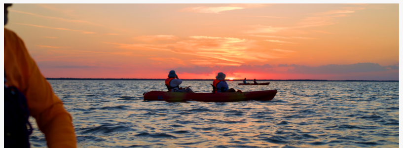
BK Adventure Sunset-Bioluminescence Tour

COCOA BEACH, FL, UNITED STATES, February 4, 2026 /EINPresswire.com/ -- BK Adventure, one of Florida's top-rated eco-tour companies, announced a Friday the 13th Flash Sale offering $13 off per person on all Sunset + Bioluminescence Kayak Tours. The promotion is available for one day only, beginning at 12:00 a.m. on Friday, February 13, 2026, and ending at 11:59 p.m. the same day.