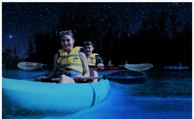
Kayaking in Bioluminescent Waters near Orlando, Florida