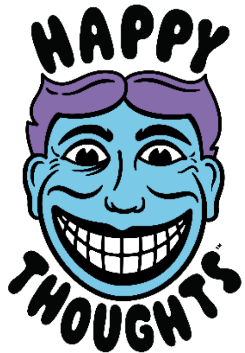
Happy Thoughts Logo with Mayor

Elixirs, the brand creates products that support brain health, enhance mood, and improve focus, all while embodying a mission to help consumers tap into the best version of themselves, one sip at a time.