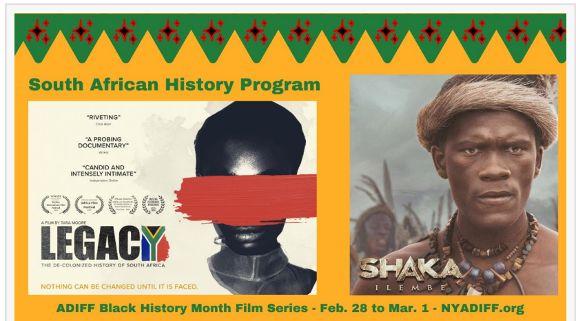
South African History Program

Intruder in the Dust is contextualized as a radical intervention in Hollywood history. Starring Juano Hernández, one of the first Afro-Latino stars in American cinema, the film rejects the servile roles typical of its era and asserts Black dignity and moral authority at the height of Jim Crow segregation.