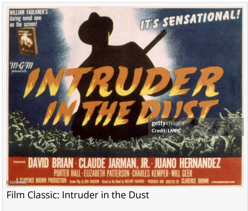
Film Classic: Intruder in the Dust

Where: Teachers College, Columbia University, 525 W 120th St, New York, NY 10027