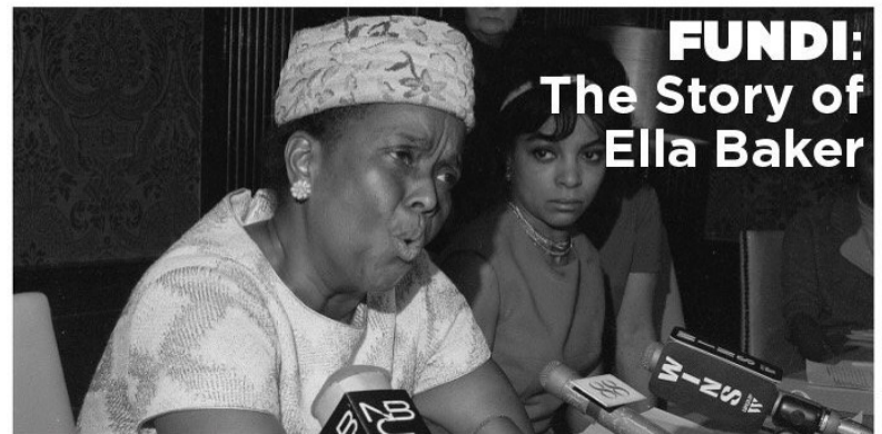
Fundi: The Story of Ella Baker