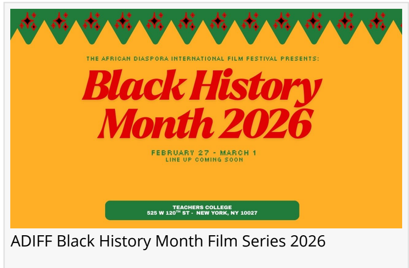
ADIFF Black History Month Film Series 2026

NEW YORK, NY, UNITED STATES, February 4, 2026 /EINPresswire.com/ -- The African Diaspora International Film Festival (ADIFF) announces its 2026 Black History Month Film Series, taking place from February 27 through March 1 at Teachers College, Columbia University. This year's edition frames Black History Month as a global conversation—one shaped by curatorial choices that cross borders, histories, and cinematic traditions.