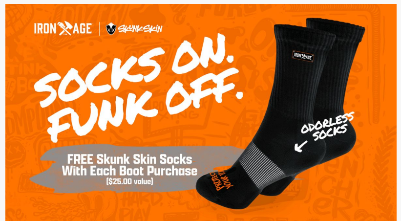
Skunk Skin Sock