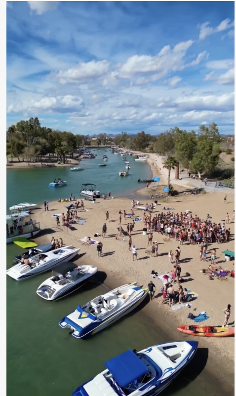
Channel in Lake Havasu

This press release can be viewed online at: https://www.einpresswire.com/article/889703296