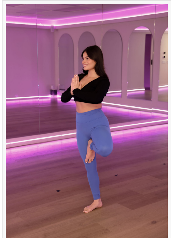
Unwind at Amalaya Yoga

Bringing affordability back into the Spring Break conversation, London Bridge Resort also introduces the Throwback Rate. A nod to a time when group trips didn't come with today's price tags. Available March 8 through March 22, the offer makes it easy for friends to split the cost and stay right on the water without stretching their budget. With four guests sharing a One Bedroom Suite or six guests sharing a Two Bedroom Suite, the rate breaks down to just $50 per person,