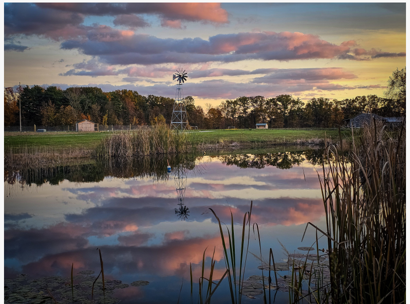
Sunset at Bellwether

The decision to appoint two farm managers emerged organically through Bellwether’s hiring process, as leadership recognized the breadth and diversity of systems operating across the farm.