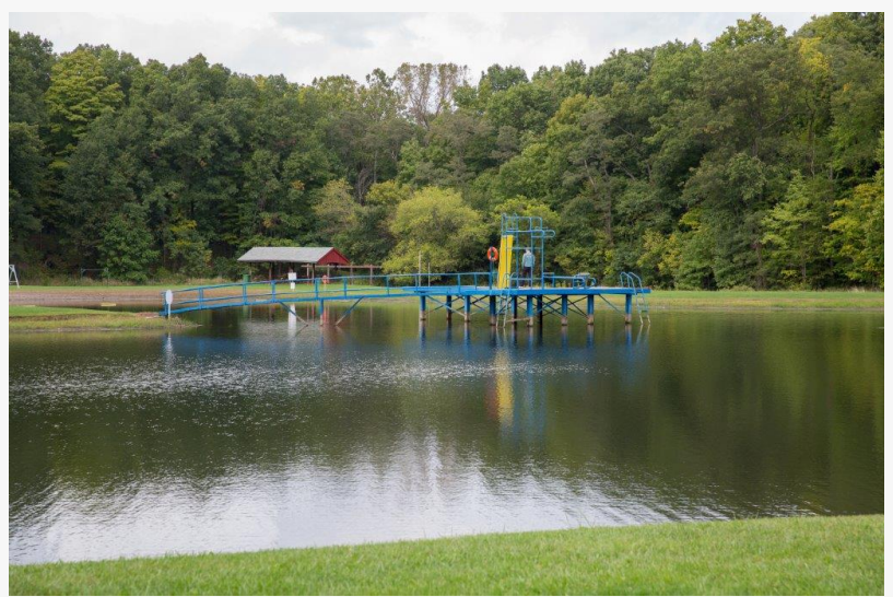
Bellwether Farm Lake