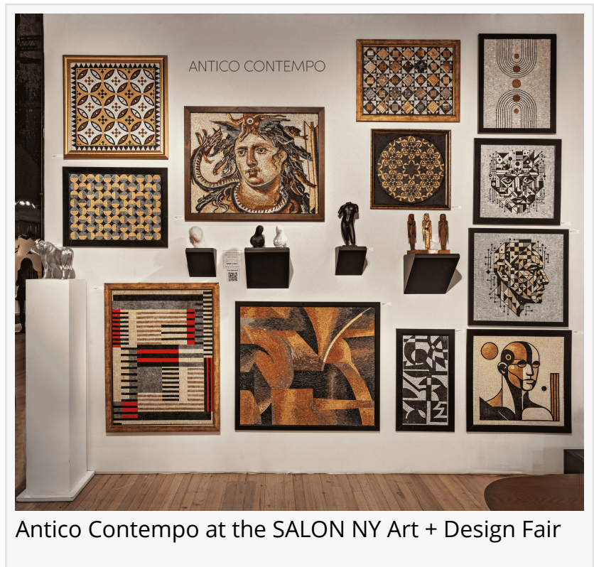
Antico Contempo at the SALON NY Art + Design Fair

This combination of ancient and contemporary offers a real-life preview of what a thoughtfully