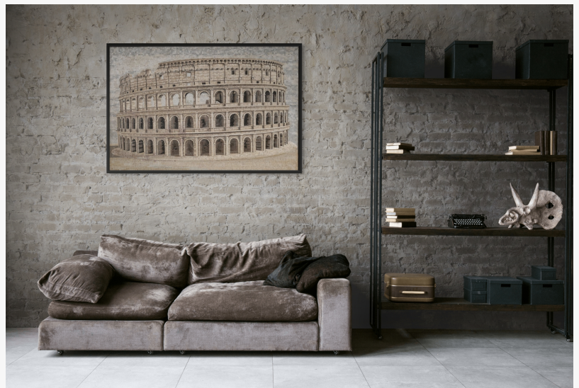
The Colosseum Reimagined by Alexander Aboutaam, 2025, Polychrome Stone Tesserae, 53x38 inches