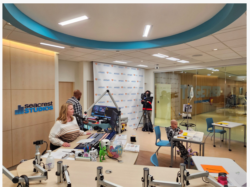
Ryan Seacrest Studio at Nicklaus Children's Hospital in Miami, Fl.

Just yesterday, the Ryan Seacrest Studios at Nicklaus Children's Hospital hosted some members of the CGAF and Coconut Grove Rotary Club to witness a drawing and card making activity, which was recorded. The class was broadcasted throughout patient rooms, and the recording was kept for all Seacrest Studios nationally to be able to access, bringing its programming into even more hospitals and community settings where children benefit most from creative outlets.