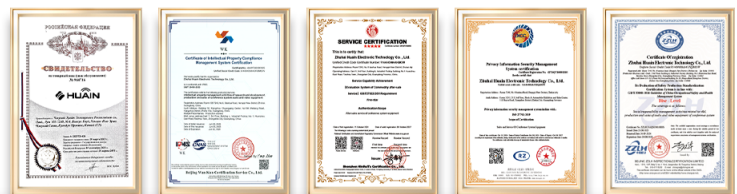
Leading Wired Conference System Company In China - HUAIN