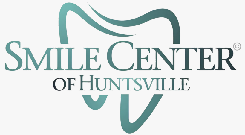
Smile Center of Huntsville

Missing teeth and unstable dentures can affect daily activities such as eating and speaking. They may also influence confidence and social interactions. The educational content on the Smile