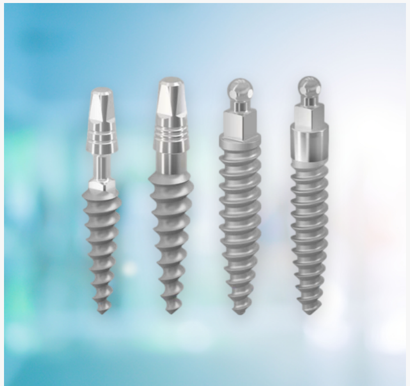
Mini Dental Implants