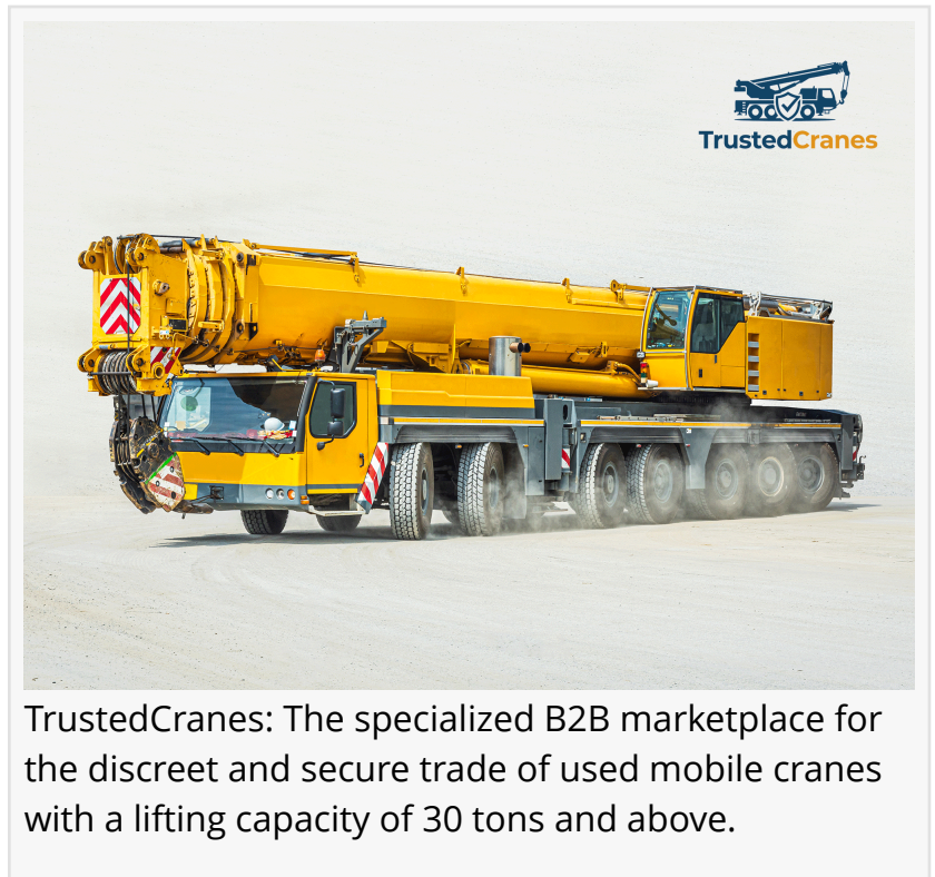
TrustedCranes: The specialized B2B marketplace for the discreet and secure trade of used mobile cranes with a lifting capacity of 30 tons and above.

To accelerate market adoption, TrustedCranes is waiving all commission fees through December 31, 2026. Sellers and buyers can use the full platform — including listing, matching, and brokerage services — at no cost during this introductory phase.