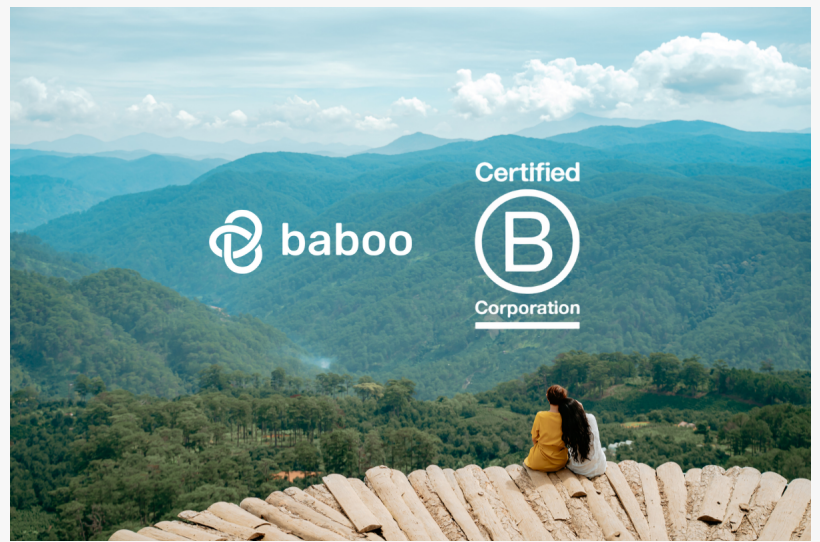
Tourists looking at a view