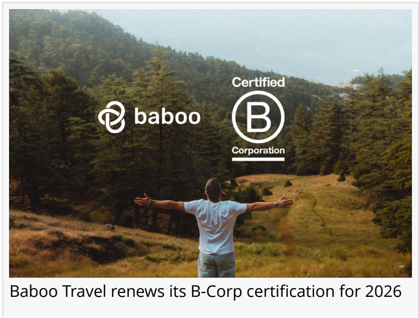
Baboo Travel renews its B-Corp certification for 2026

DOVER, DE, UNITED STATES, February 8, 2026 /EINPresswire.com/ -- Baboo Travel has officially renewed its B Corp certification for 2026, marking a significant milestone in the company's mission to redefine the travel industry. This renewal confirms the company's continued adherence to independently verified, gold-standard benchmarks for social and environmental performance, accountability, and transparency.