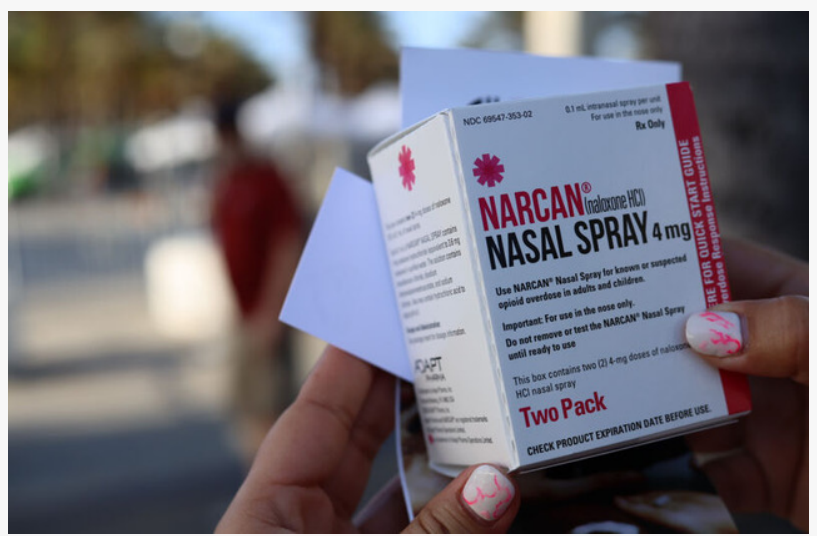
Narcan Boxes distributed by The Robin Foundation

The cabinets are intentionally modeled after other accepted emergency-response infrastructure—such as AED cabinets—reinforcing the message that overdose response belongs in standard public-safety planning.