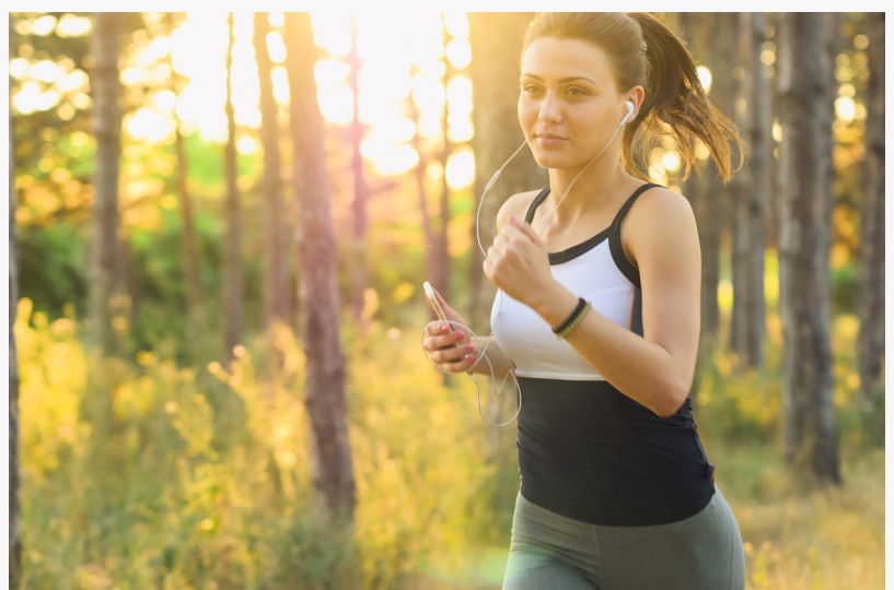
Mosaic Medicine supports women in achieving balance, vitality, and long-term wellness.

By operating independently of insurance billing, Mosaic Medicine is able to streamline administrative processes and dedicate more time and resources to patient care. This structure supports a more efficient and responsive healthcare experience for families.