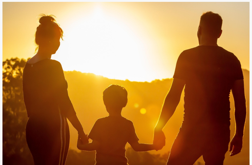
Putting family health first. At Mosaic Medicine, our membership-based Direct Primary Care model ensures personalized, accessible, and proactive care for every member of your family.