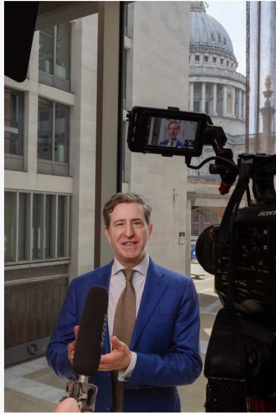
TV Interview - Roger Spitz Media Tour (London 2026)

To meet the escalating demand for actionable foresight and strategic intelligence, Spitz launched the "Visionary Trilogy" global speaking tour in 2026. This hugely popular series of flagship