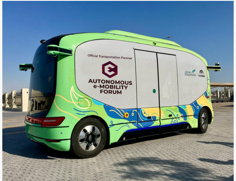
Autonomous e-Mobility Forum Autonomous Bus