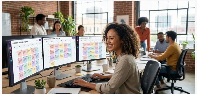
AI-DRIVEN SOCIAL MEDIA MASTERY: BUILT FOR CREATORS, STRATEGISTS, AND MARKETERS WHO SCALE.

Reduce workflow time by up to 80% using engineered prompt frameworks.