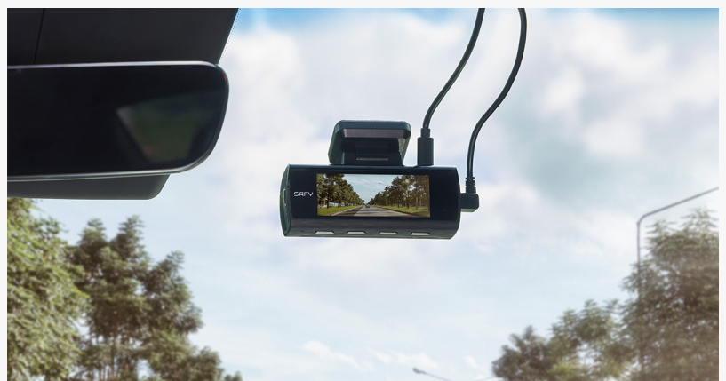
SAFY9 earns Amazon's Choice

IRVINE, CA, UNITED STATES, February 9, 2026 /EINPresswire.com/ -- BlackVue's premium front and rear dash cam , SAFY9 2CH, has earned the Amazon's Choice badge, demonstrating strong product competitiveness and customer trust. Amazon's Choice is awarded based on customer ratings, sales performance, and price competitiveness, making SAFY9 a top recommendation for drivers. To celebrate this achievement, BlackVue is offering a limited-time special discount on SAFY9 2CH, giving customers an opportunity to experience premium 4K protection at a more accessible price.