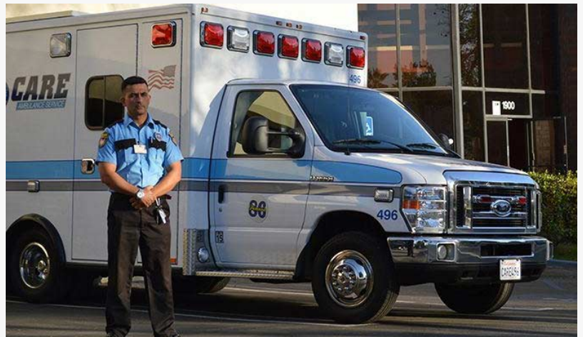
Security guard _service