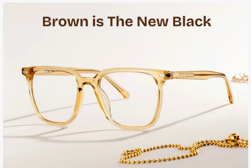
Eliza Square Beige TR90 Eyeglasses