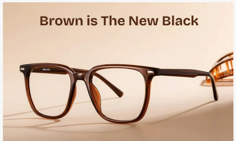
Eliza Square Dark Brown TR90 Glasses1

ZEELOOL is having special deals in February to celebrate the release of their new range. All new